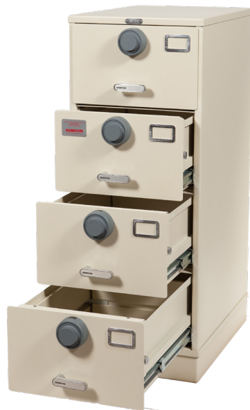
Class 6, 4 drawer, legal size, multi-lock in parchment shown below