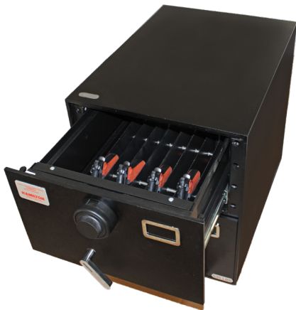
Class 6, legal size, single lock in black shown above