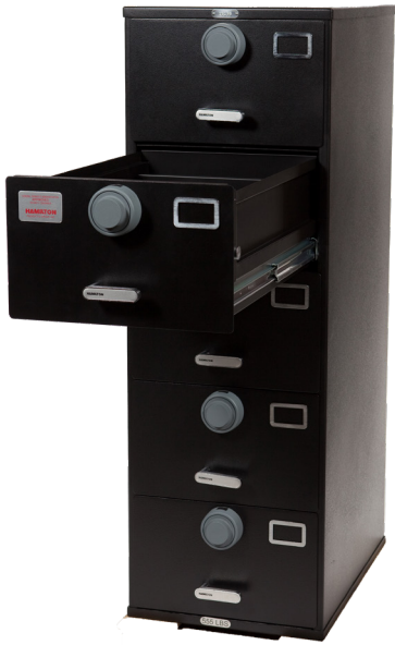
Class 5, 4- drawer, legal size, multi-lock in black shown to left

The Class 5 cabinets are approved for the storage of secret, top secret, and confidential, as well as Class 1 & 2 controlled substances, monetary funds, and precious metals. While the Class 6 cabinets are approved for the storage of secret, top secret, and confidential