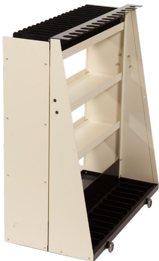
"T" High Barrel Support